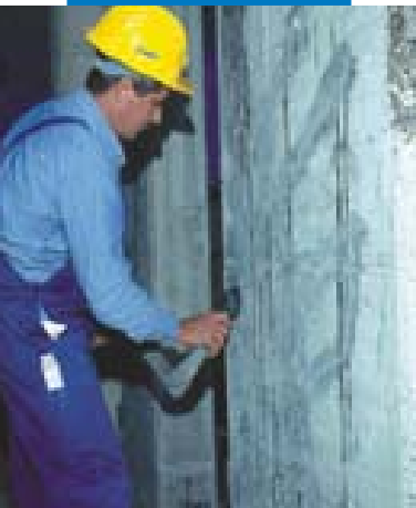
Preparing the substrate