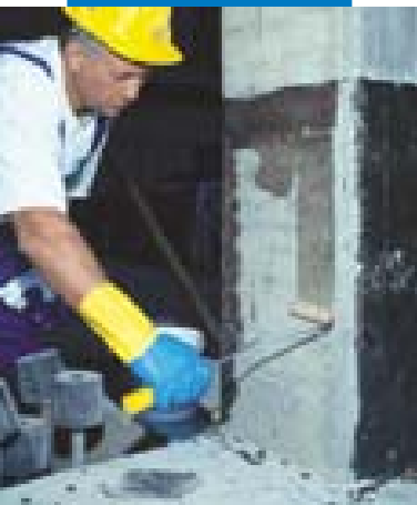
Applying Mapewrap Primer 1