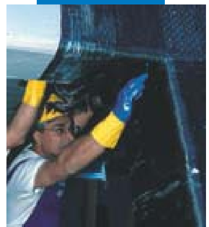
Wrapping a hitch