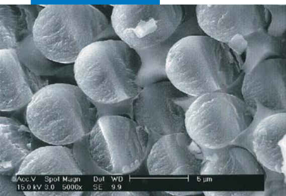
A microscope photograph of a polymeric matrix structural composite from the Mapei R&D Laboratories

All relevant references of the product are available upon request.