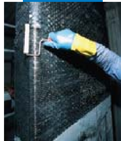
Applying a second coat of Mapewrap 31

N.B. - Although the technical details and recommendations contained in this product report correspond to the best of our knowledge and experience, all the above information must, in every case, be taken as merely indicative and subject to confirmation after long-term practical applications: for this reason, anyone who intends to use the product must ensure beforehand that it is suitable for the envisaged application: in every case, the user alone is fully responsible for any consequences deriving from the use of the product.