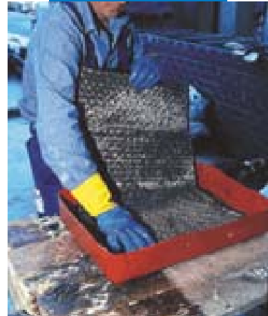
Manually impregnating Mapewrap C