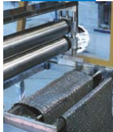
Impregnating Mapewrap C with a machine